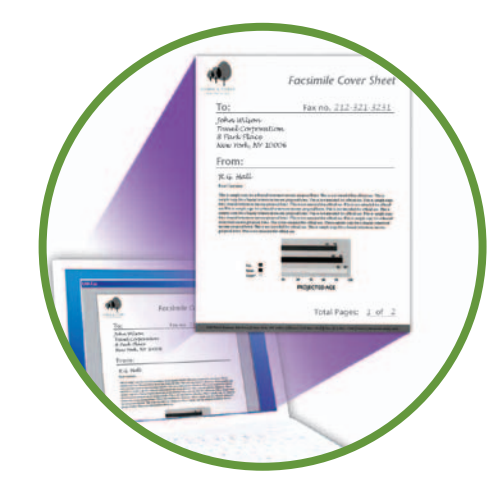
Deliver any document to the Ricoh FAX4430NF for transmission, right from your PC, with the LAN faxing feature.